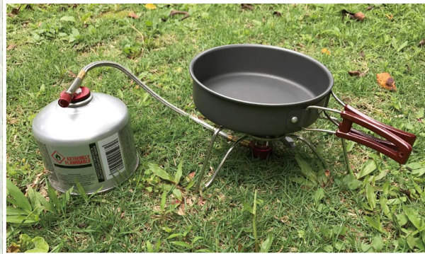
煮食用具 Cooking appliance

常見的露營氣體用具： Common camping gas appliances: