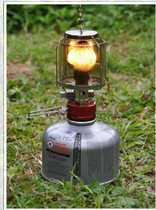
氣體露營燈 Gas camping lantern